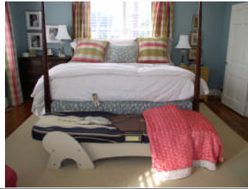
Get creative with your Migun bed at home-this one disappears!

"Having a Migun bed at home means that I take time for me, no matter what my day brings," says a happy bed owner from 29615. "I live near Migun, but there is nothing like a P5 before bed after all the responsibilities for the day are over."